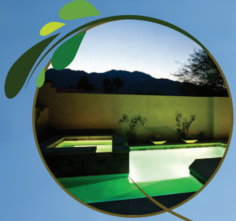
Variable-speed Pump Motors