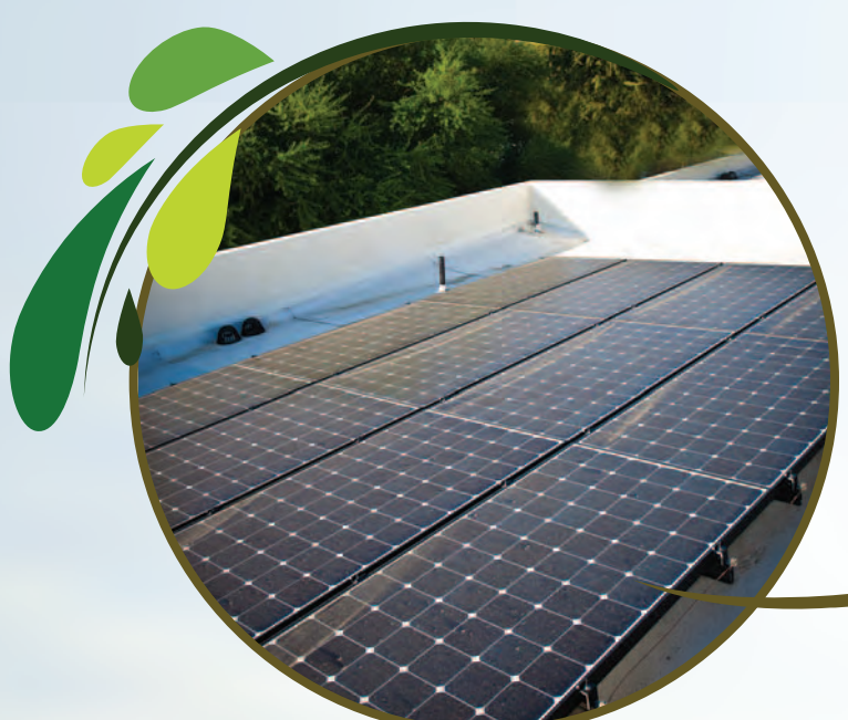
Solar Roof Panels

Increased comfort due to better operation Improved indoor air quality Lower utility bills Consistent comfort level throughout the home Variable Speed Pool Pump Motor Lower utility bills Quieter operating system