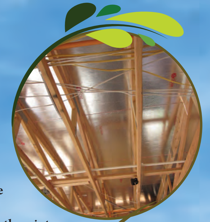
Radiant Roof Barrier Panels (Throughout entire roof)

Lower utility bills Improved appliance performance Increased energy efficiency Cooler in the summer, warmer in the winter