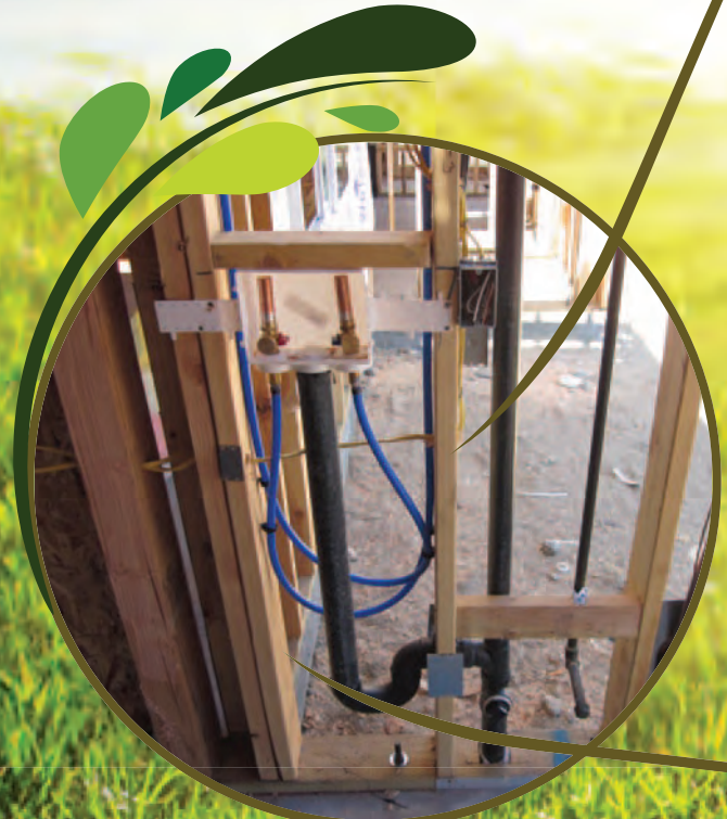
2 X 6 Framing

Most homes 2 X 4 framing Extra 2" for deeper insulation Stronger construction strength