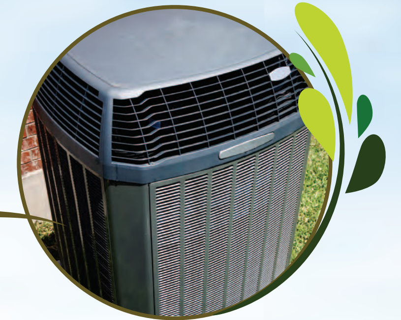
High Efficiency HVAC System

Increased comfort due to better operation Improved indoor air quality Lower utility bills Consistent comfort level throughout the home Variable Speed Pool Pump Motor Lower utility bills Quieter operating system