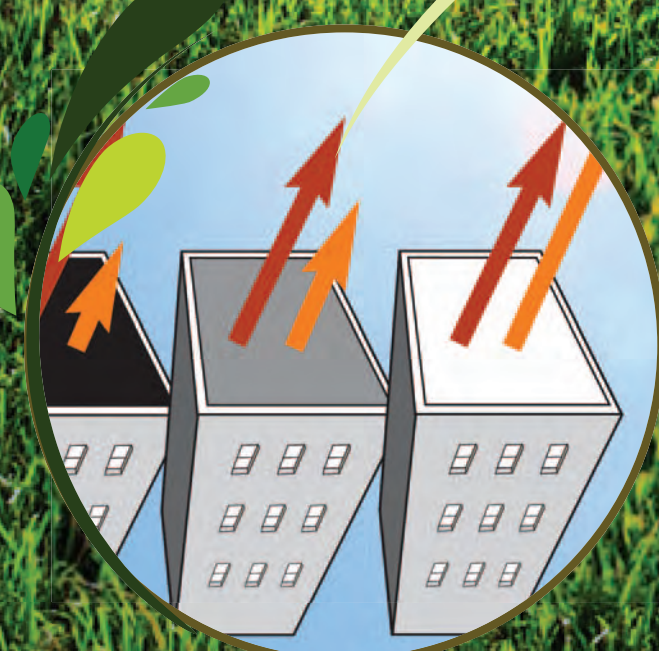
CoolStar® Coated Roof Surface (Complete roof coverage)

Exceeds Energy Star and Title 24 requirements Reflects heat Delivers a cooler more comfortable interior Seals roof from rain leaks