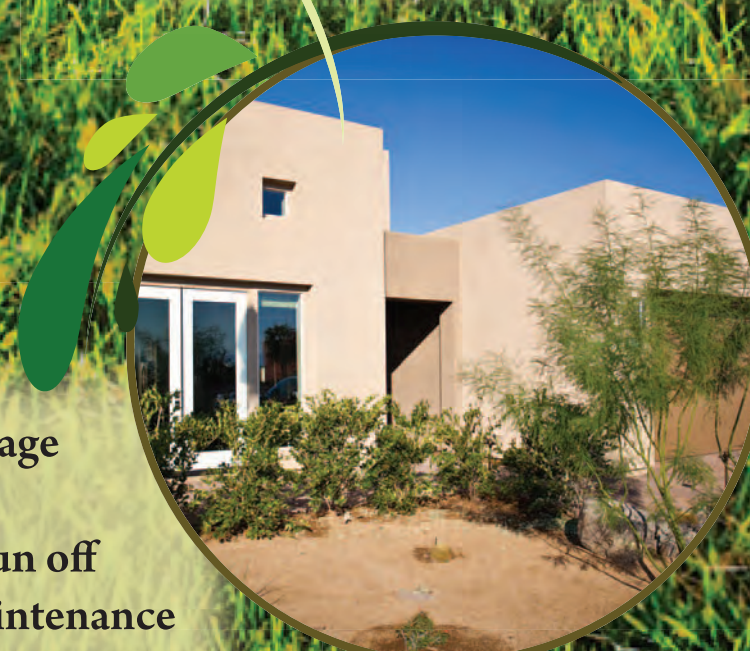
Drought Tolerant Drip Irrigation Landscape System

Reduces water usage Lower water bills Reduces waste/run off Reduces yard maintenance