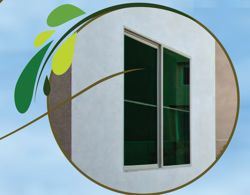
Solarban 70XL Glass Windows

Low E glass Dual paned windows Warmer in the winter Cooler in the summer Comfortable abundant light Fade protection