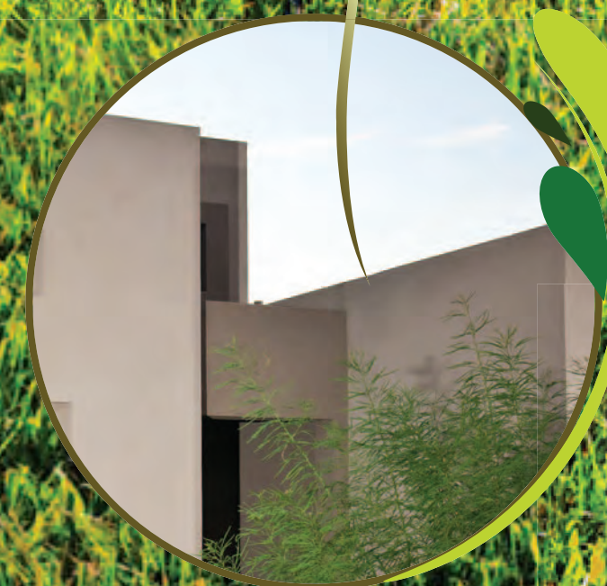
One Coat Stucco Wall System

Will last for decades with little maintenance Durable and impact resistant Fire resistant Improved energy efficiency Fungus, rot and insect resistant Helps increase R value