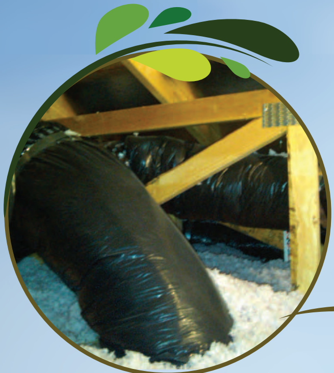
Tight Duct System

Increased comfort due to better air distribution Improved indoor air quality Less dust, pollen and other pollutants Lower utility bills Consistent comfort level throughout the home Less drafts Quieter home