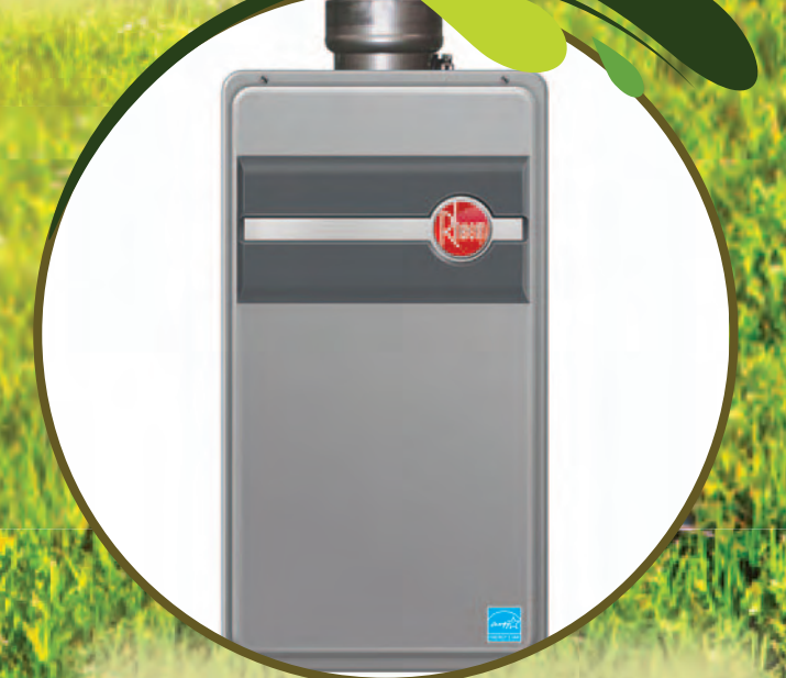
Tankless Hot Water Heating System

Constant hot water Energy efficient design Low cost operation Compact size Precise temperature control Self diagnostic